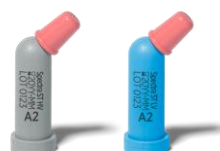
Ceram.x Spectra® ST Universal Composite Restorative