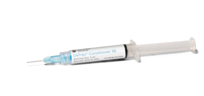
DeTrey® Conditioner 36 Phosphoric Acid Gel