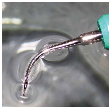
Figure 1. Visual image of acoustic turbulence (water current created by oscillating tip).

instrument and all of the inserts or tips associated for thorough debridement. One of the claimed benefits with the use of powered instruments is that it takes less time to complete the procedure. 15 This statement may mislead the clinician into spending insufficient time with their ultrasonic devices. Part of the skill in using this method, is spending adequate time in the treatment area.