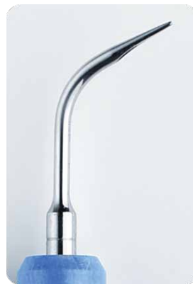
Figure 2. #10 tip, single bend, standard diameter.