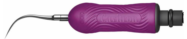
Figure 11. Ergonomic grip for ultrasonic scaling.

All ultrasonic machines and instruments need to be maintained to manufacturer's recommendations to achieve long life. Water filters, O-rings and line flushing are essential regular maintenance tasks to ensure safety and proper operation of these devices. In addition, the tips for piezoelectric and inserts for magnetostrictive need to be monitored regularly.