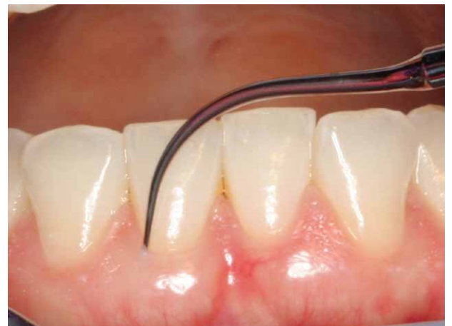
Figure 8. Thin insert. 47% thinner and 9° back bend angle for access.

Other important keys to ultrasonic technique are adaptation of the tip to tooth, instrument stroke, grasp and lateral pressure. Small adjustments to each of these categories can increase your scaling effectiveness significantly. The