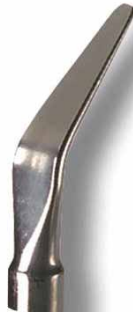
Figure 5. Beavertail tip, used for heavy calculus bridges. The working area is the point of the instrument.

Slim diameter tips are generally available in the same tip designs as the standard diameter tips. The diameter of the tip is 30% smaller than the standard tip. This slimmer design can access deeper pockets and furcation areas and are especially suited for root anatomy. 20,21,3 In addition to the designs earlier mentioned, there is also a curved design available in the slim inserts. These curved instruments are intended for posterior root adaptation and have much better contact with convexities and concavities than do the straight tips.