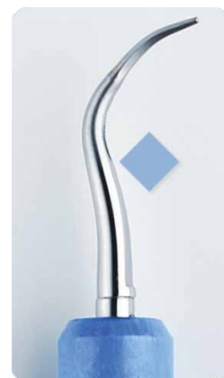
Figure 4. #1000 tip triple bend, standard diameter; beveled edges are areas of high energy.

sert has “bladed” edges, the power distribution is stronger at the apex of the edge. The triple bend has improved line angle and interproximal adaptation. The beveled edge is extremely efficient at removing moderate to heavy calculus in these areas. This tip is also effective on the buccal and lingual aspects. It is important to examine the design of this particular insert, as it does have some limitations. Because of the bends, this instrument will not adapt well in pockets >4\text{mm} and will cause significant damage to root and tooth structure if the point comes in direct contact at