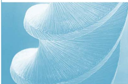
Flat radial lands

The ProFile GT file's radial lands and U-shaped flutes lift debris coronally. These design features help keep the instrument centered in the canal preventing stripping and zipping of the canal. They also reduce the risk of transporting, ledging and perforating the canal.