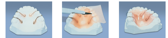
1. Adapt Gel or TranSheet around wires to secure. 2. Adapt TranSheet to cast. Trim. 3. Process in Triad Unit. Finish as required.