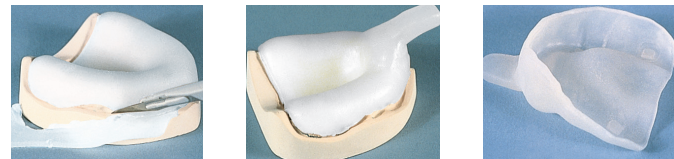
1. Adapt material, trim. 2. Create handle. 3. Brush with ABC, cure in Triad Unit.

The difference between these two materials is TruTray has 200% greater stiffness, providing the ultimate in tray stability and 50% greater flex strength than Original Blue CustomTray. TruTray's translucency also gives you a visible benefit when adapting to a marked cast.