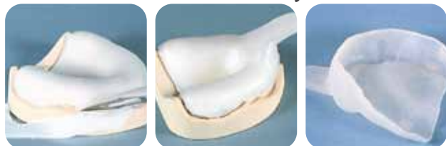
1. Adapt material, trim. 2. Create handle. 3. Brush with ABC, cure in Triad Unit.

The difference between these two materials is TruTray has 200% greater stiffness, providing the ultimate in tray stability and 50% greater flex strength than Original Blue CustomTray. TruTray's translucency also gives you a visible benefit when adapting to a marked cast.