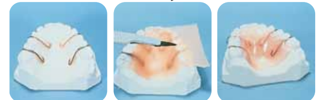
1. Adapt Gel or TranSheet around wires to secure. 2. Adapt TranSheet to cast. Trim. 3. Process in Triad Unit. Finish as required.