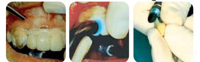
1. Place material in a clear matrix, press in place. 2. Set facial/lingual surfaces with light wand, then process in Triad Unit. 3. Remove from matrix, confirm fit. Trim, process, and finish.