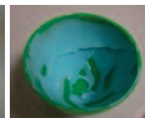
0-30 sec. Fuschia during mixing