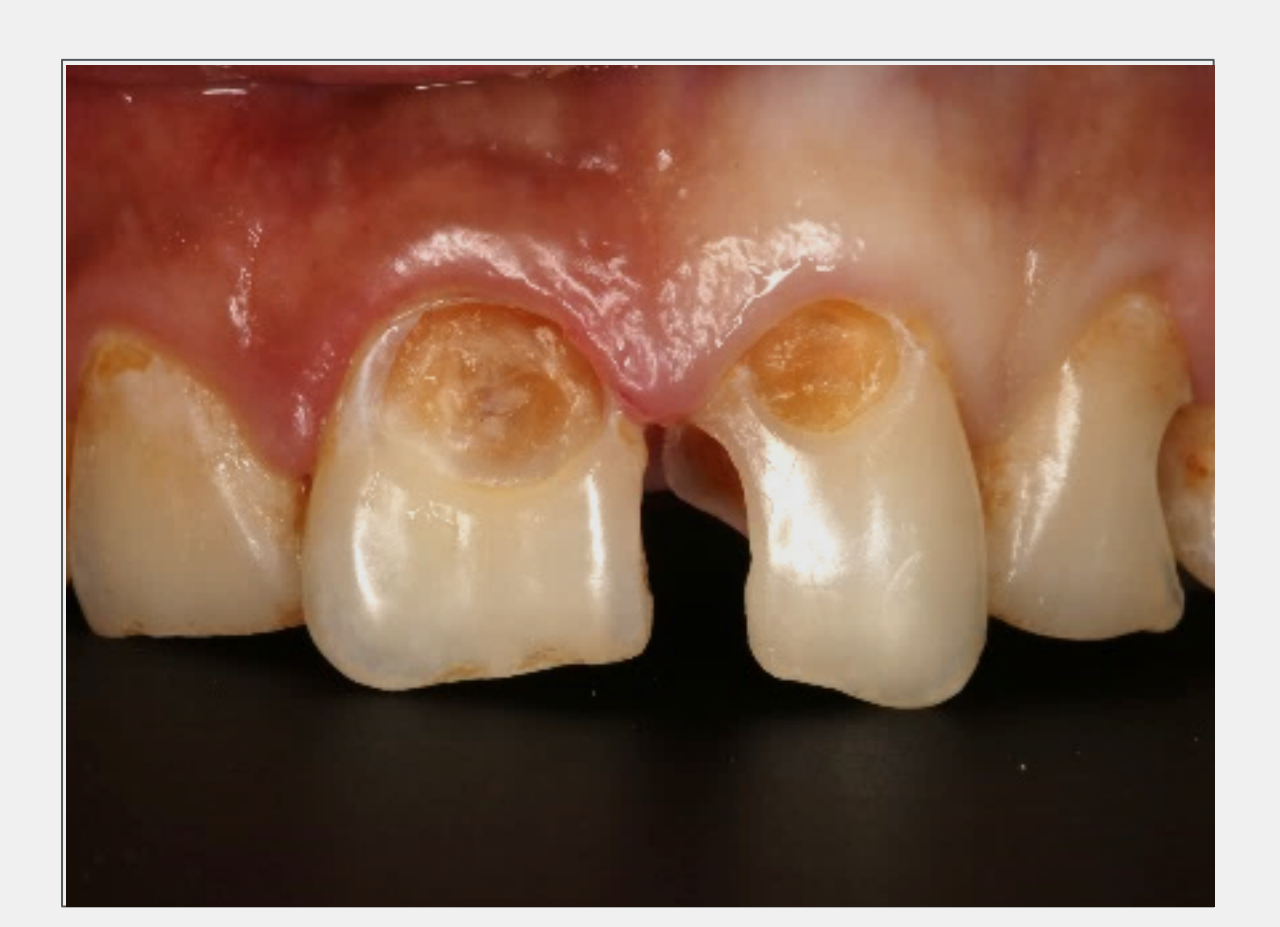
Caries treatment and cavity preparation

Caries was removed carefully to preserve vital pulp. Temporary fillings were made with glass ionomer.