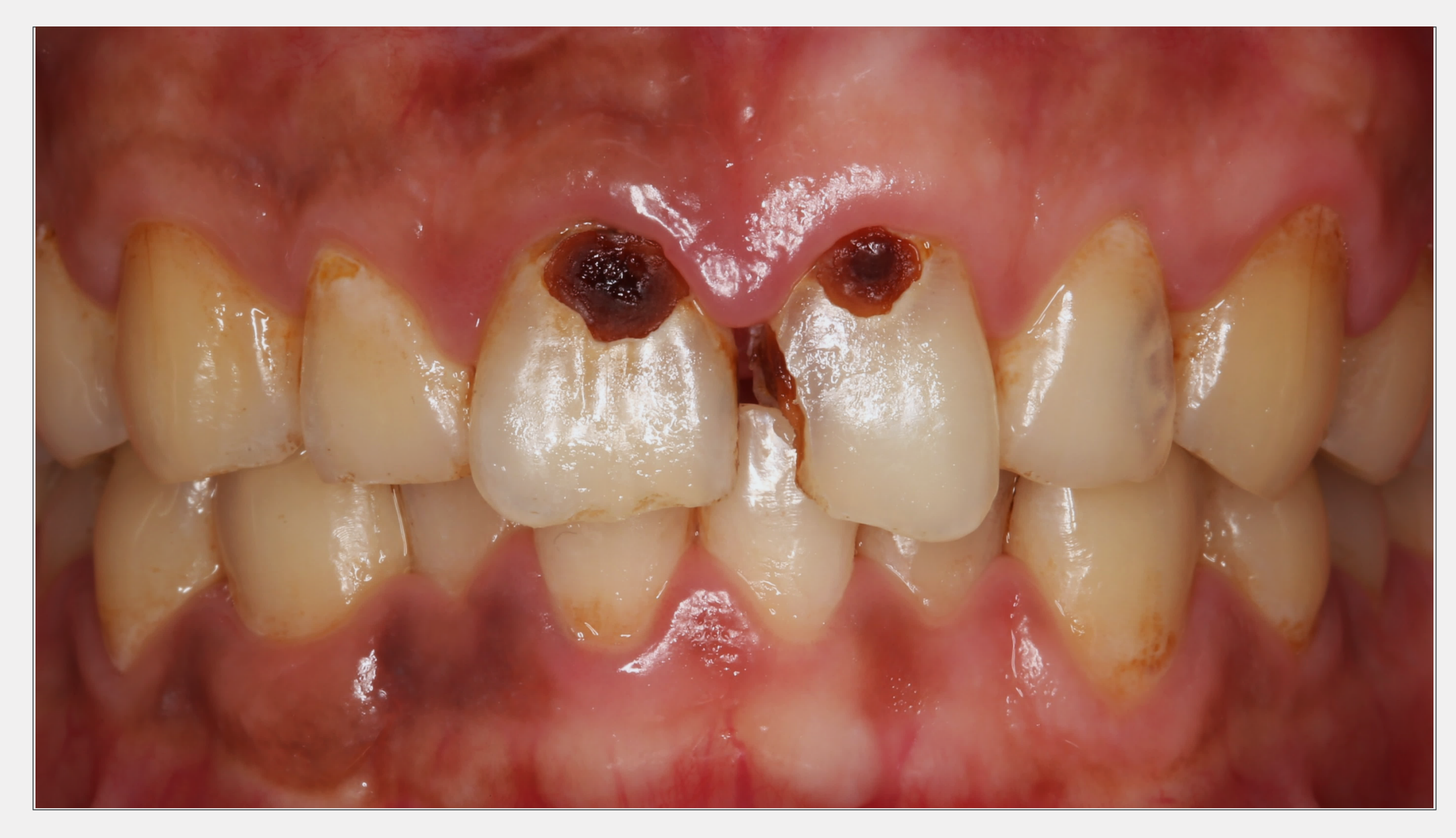
Pre-operate look showed caries lesions on #8, #9, #10 affecting cervical region and incisal edge. The incisal line and width of #8, #9 were lack of proportion.

A 22-years-old male came us complaining about poor esthetics of his anterior teeth. After analysis, direct composite restoration was chosen to rehabilitate the caries lesions and make micro-adjustment to his incisal line. In this case, direct composite restoration is the preferred option for multiple caries lesions combined with aesthetic adjustment demand. Aesthetic and functional rehabilitations were achieved with the state-of-the-art nano ceramic restorative.