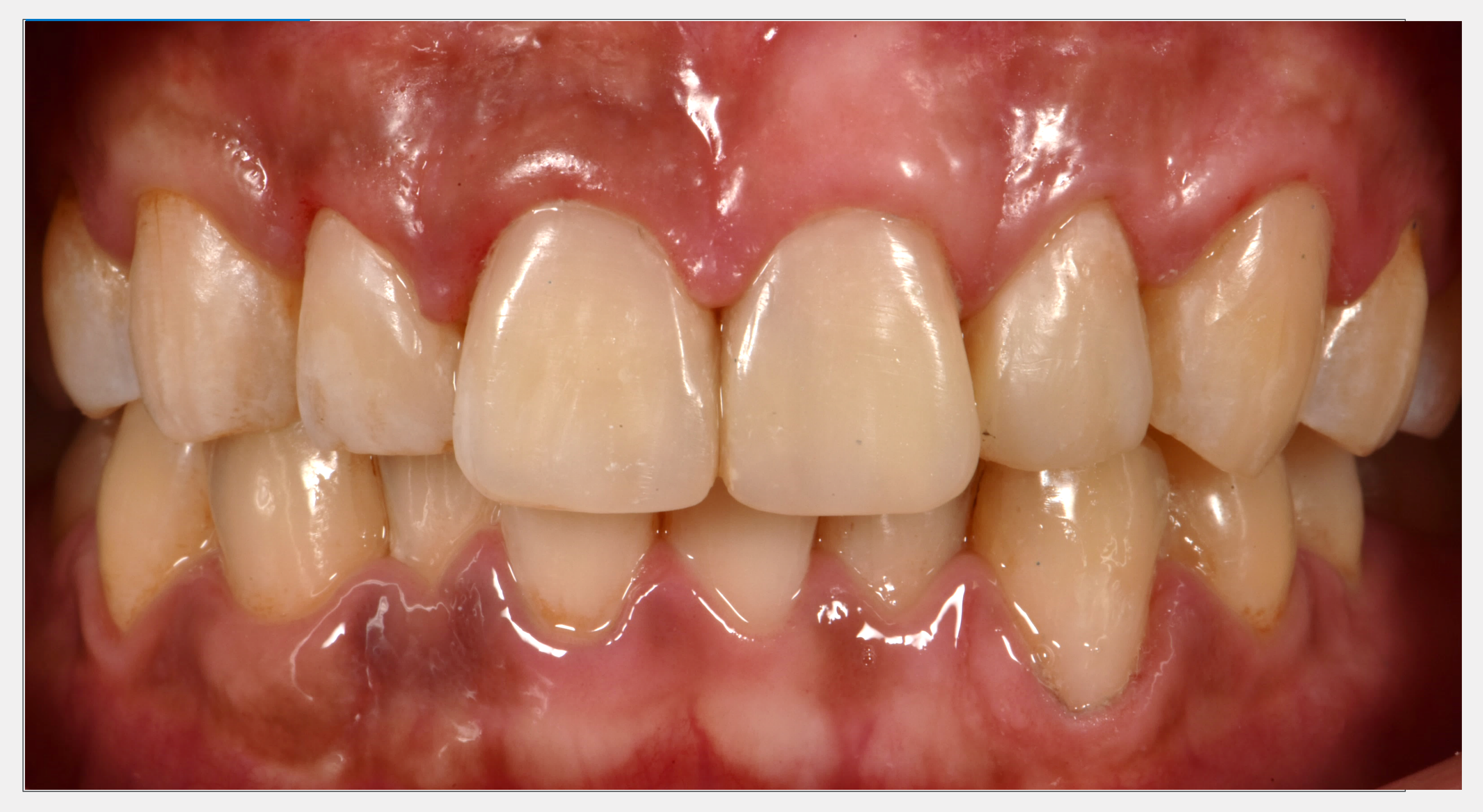
Final result showed reconstructed #8, #9, #10 with color and translucency blending in the surrounding teeth. Aesthetically pleasing incisal line was created. Patient's satisfaction was obtained.