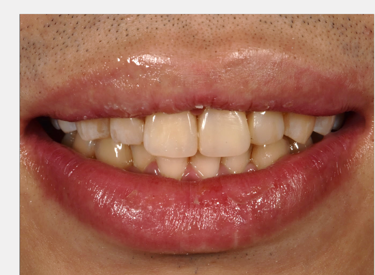
Immediate result with smile

The lateral view revealed desirable color and opalescence effect of the additional restorations. The high-end glossy finish and vivid micro-texture successfully