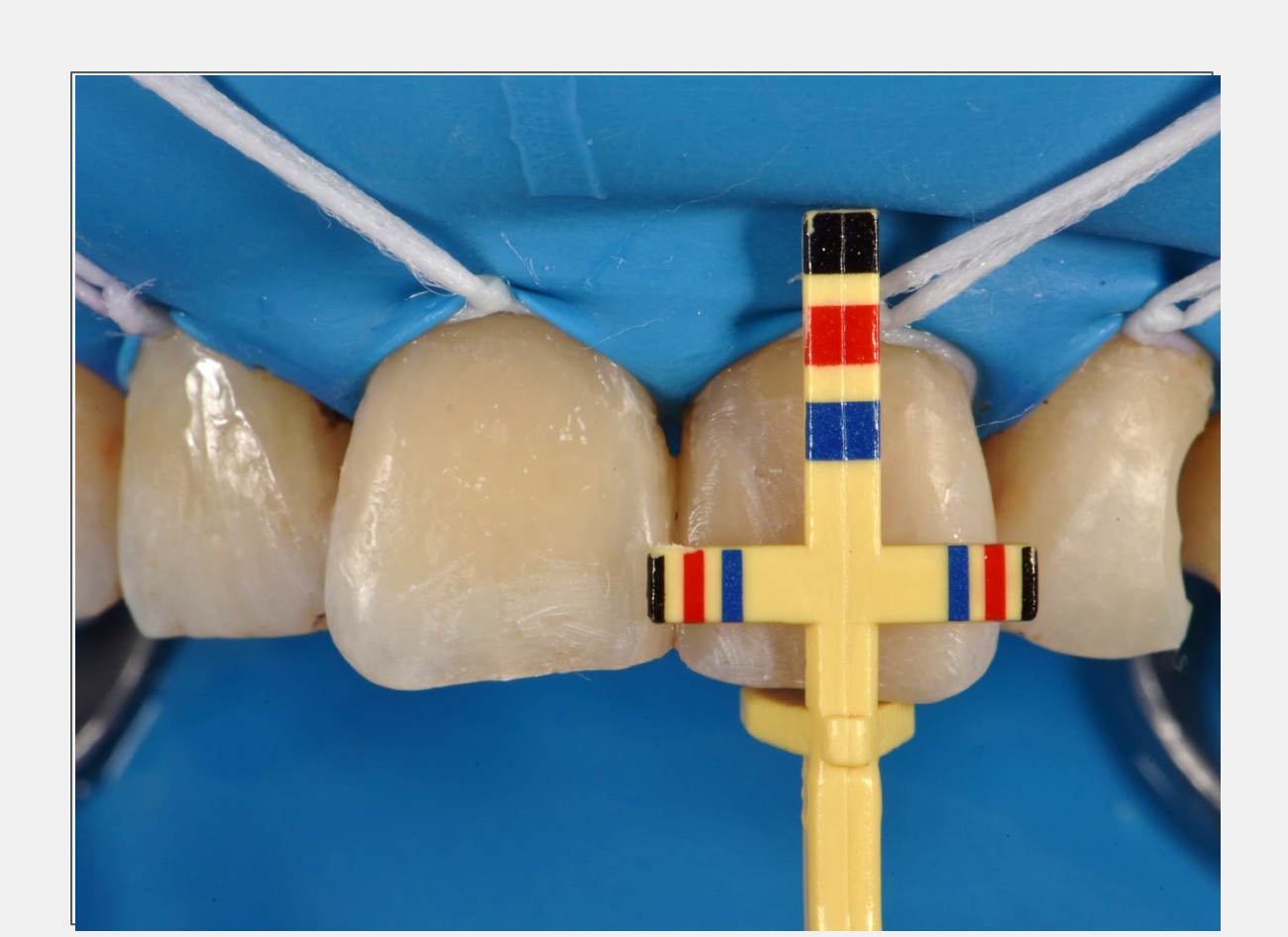
Measurement and Additional restoration

According to digital smile design (DSD) and clinical assessment, the aesthetic complication of #7, #8 were the concaved incisal line and asymmetric width.