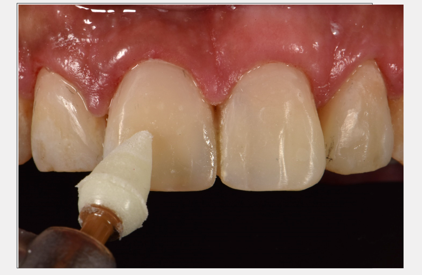
Polishing and finishing

#8 and 9 were measured by proportion gauge tip. Additional restorations on #8 and 9 was sculptured under the guidance of wax-up (Ceram.x® duo D2, E3).