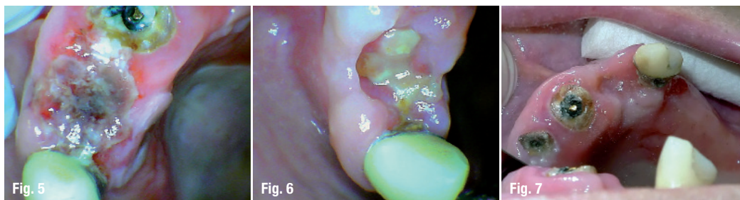
Fig. 5: The clinical situation following LLLT around the extracted tooth 12 after one day.