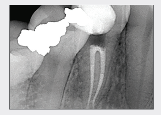
Using different formulations of gutta-percha in one case can cause varying degrees of opacity.