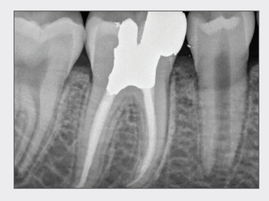
Gutta-Smart™ and Conform Fit™ master cones feature the same advanced gutta-percha for radiographic consistency.