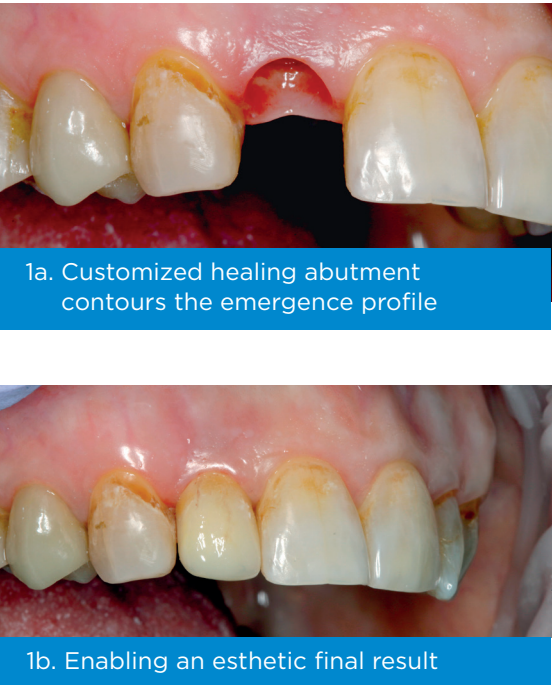
1a. Customized healing abutment contours the emergence profile