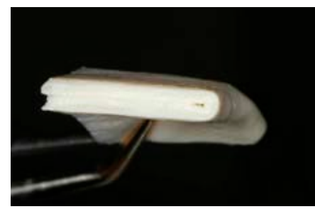
5. OSSIX Volumax folded in half for additional tenting and tissue thickness.