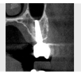
16. 3 year follow up. Continued OSSIX Volumax ossification visible.