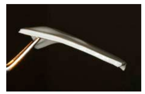
4. OSSIX Volumax (25x30mm) after hydration in sterile saline.