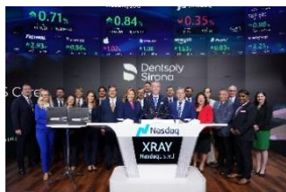
Fig. 1: Dentsply Sirona Rings the Nasdaq Closing Bell in honor of significant product launch.