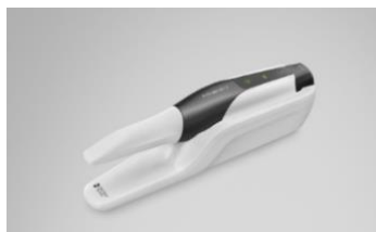
Fig. 2: Primescan 2, the first cloud-native intraoral scanner opens a new era of digital patient care