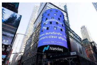
Fig. 6: SureSmile® Clear Aligners