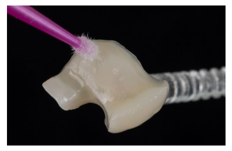
A silane coupling agent (Calibra Silane, Dentsply Sirona) was applied prior to adhesive luting of the restoration.