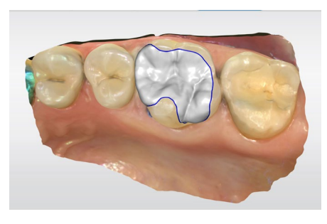
Design proposal generated with the "biogeneric individual" function.