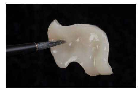
For the final step, a glaze firing (with e.g. DS Universal Stain & Glaze System) is mandatory.