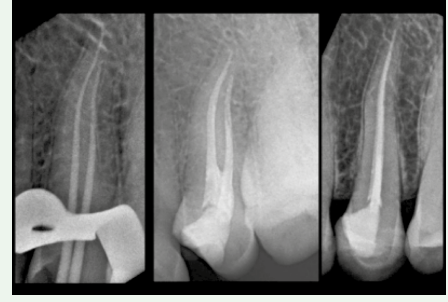
Postoperative radiographs with multiplanar in bucco lingual direction

Thanks to the pretreatment planning of access cavity, I have been able to preserve a healthy crown structure and structural root dentin integrity with the objective of long term tooth survival.