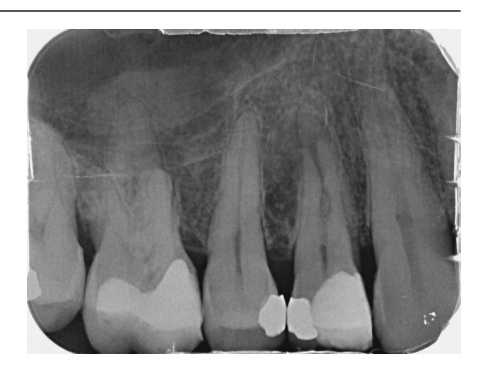
Figure 1: Preoperative radiograph from the referring dental clinic shows an extensive apical lesion

Pulp necrosis, chronic apical periodontitis associated with a fistula.