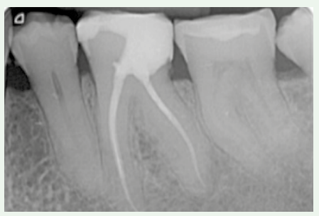
14 month follow up showing resolution of the periapical radiolucency