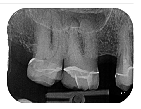
Figure 1: PreOp radiograph showing signs for apical periodontitis and root canal obliteration on tooth 16

Pulp necrosis with acute apical abscess tooth 16.