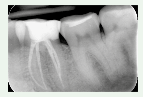
Figures 4: Postoperative radiograph showing conservative shaping technique ideal for the tiny roots