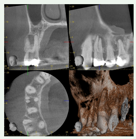
Figure 2: CBCT shows an interesting anatomy of a premolar with three very slim roots

The CBCT showed an extensive destruction of the bone with a perforation on the buccal side and a premolar with three very slim roots. After accessing the tooth under the operating microscope, TruNatomy® was chosen to prepare the delicate anatomy of the tooth up to TruNatomy® Medium. Irrigation was enhanced using laser activation of EDTA 17% and 3% sodium hypochlorite according to the sweeps protocol. Calcium hydroxide was placed in the canals and the tooth closed with a temporary restauration. During the second appointment, the fistula was closed. After repeated laser activated disinfection, the tooth was obturated using the warm vertical compaction technique and restored immediately with an adhesive build up.