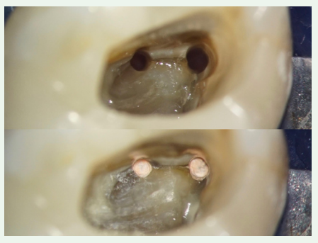
Figure 3: Mesiobuccal root canal system after cleaning, shaping and obturation