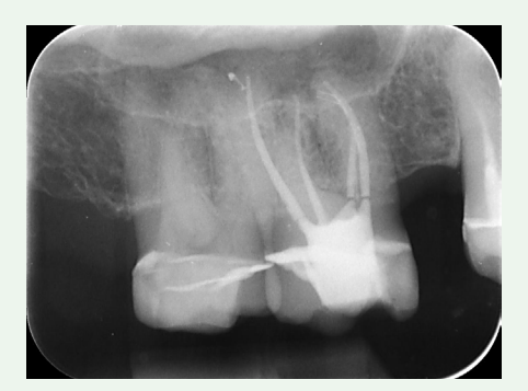
Figure 4: PostOp radiograph showing sufficient root canal obturation and temporization