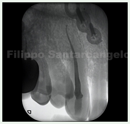
The smooth curvatures of this canine were beautifully shaped by TruNatomy*, ensuring high respect of the original anatomy

On top of being conservative, TruNatomy® allows deep cleaning following the dedicated irrigation protocol.