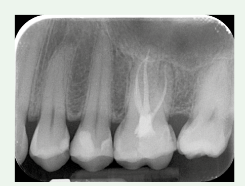
Postoperative radiograph showing satisfactory filling of the canals and restoration