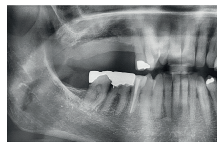
2. Radiographic assessment indicated that there was ample bone depth in the posterior maxilla to allow for satisfactory implant placement.