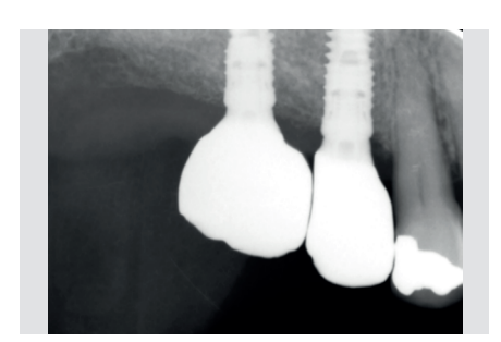
16. Radiograph to verify correct seating of restorations.