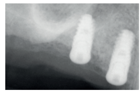
11. Radiograph of implants post-operatively.