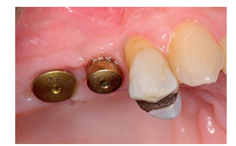
12. Healing Abutment EV (M) placed at 3 months after initial surgery.