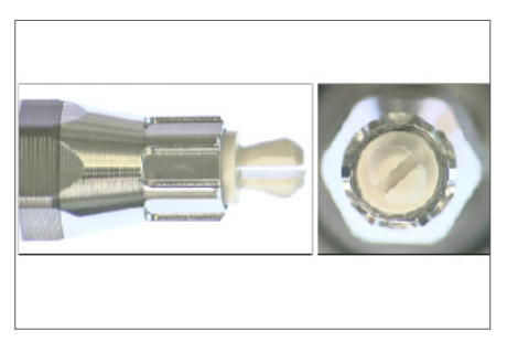
7. The new design of Implant Driver EV features a PEEK portion on the tip, which is activated when installed into the implant to secure the engagement.