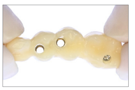
14. Temporary screw-retained restoration for Immediate Smile.