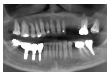
2. Pre-operative radiograph.