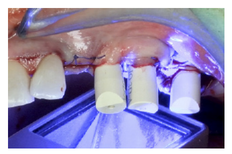
13. Scan bodies were attached for digital impression taking.