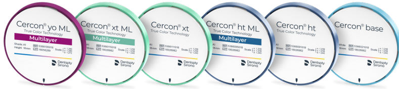
Cercon® Zirconium oxide

Dentsply Sirona's digital production units offer practices and laboratories the economical and precise fabrication of flawless and esthetically high-quality prosthetics.