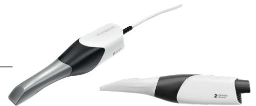
Primescan® and Primescan® 2 Intraoral scanners for high performance