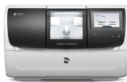
CEREC Primemill Fast and accurate