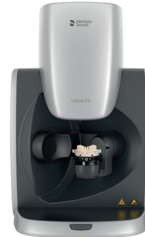
inEos X5 One scanner, many options