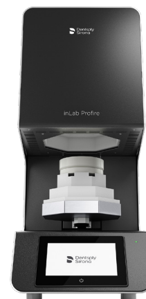
inLab Profire Sintering furnace

All Discs are available in the standard 98 mm diameter size.