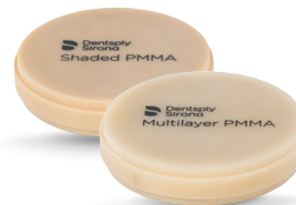
PMMA Shaded and Multilayer