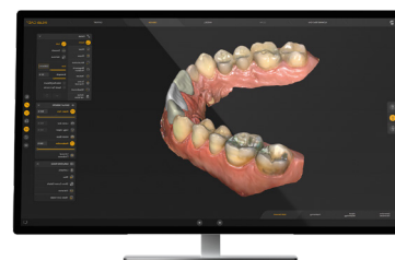
inLab CAD Software User-friendly restoration design