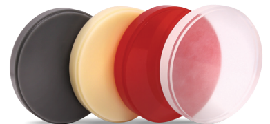
Wax & Burn out PMMA