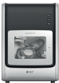
inLab MC X5 Universal production use