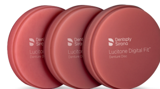
Lucitone Digital Fit ™ Digital fabricated denture bases