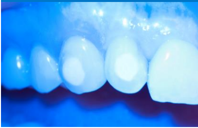
10. Check for flash