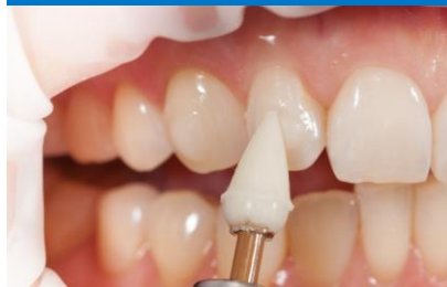
11. Flash removal