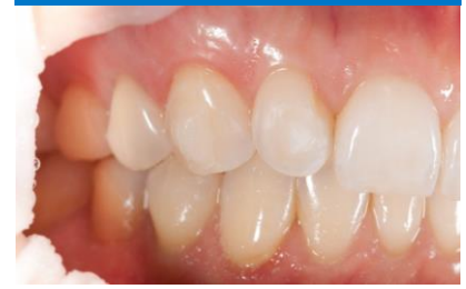
12. Polish attachments