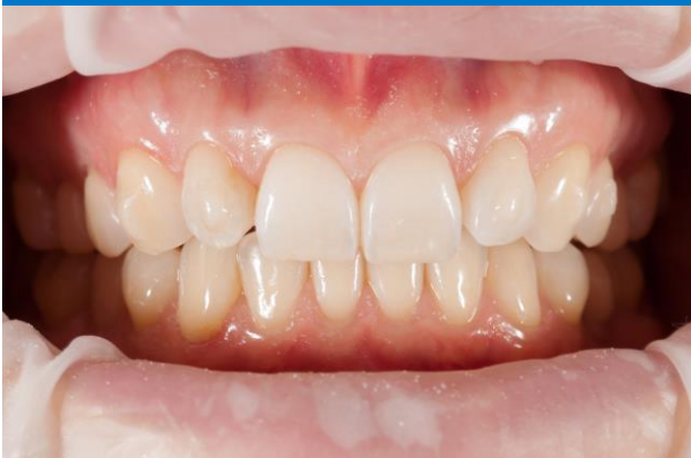
Bonded attachments with TPH Spectra® ST composite