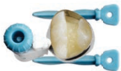
Palodent® 360 Circumferential Matrix System

Healthy Practices, Healthy Smiles start with a Class II product lineup designed for safety, efficiency and predictable outcomes.