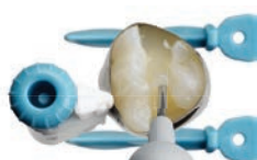
SDR® flow+ Bulk Fill Flowable