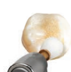
Enhance® Finishing System