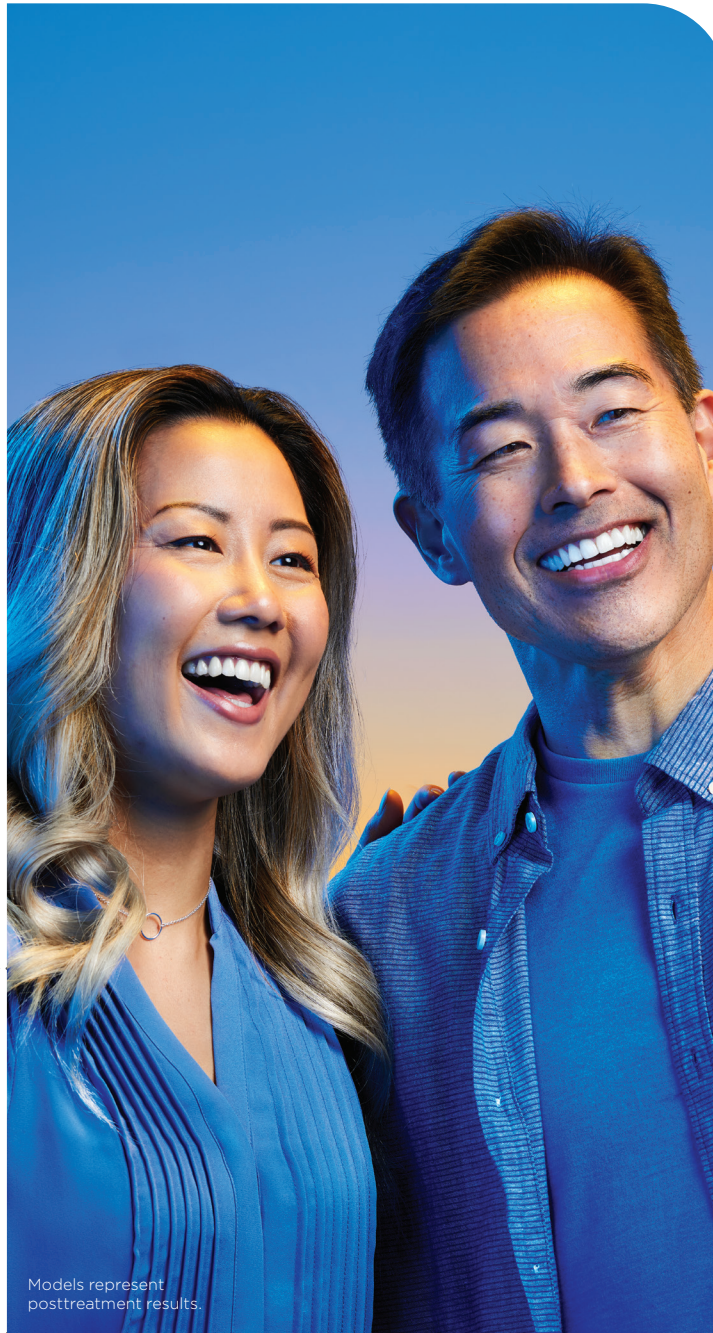
Models represent posttreatment results.