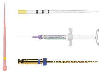
Fig. 1: ProTaper Ultimate is the fourth generation of Dentsply Sirona's flexible endo-file system with ProTaper-Ultimate-Absorbent-Point, AH-Plus-Bioceramic, Protaper-Ultimate-HandUse File and ProTaper-Ultimate-Gutta Percha (top down).

are available for > Download on the website.